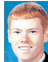
WARD Coal City