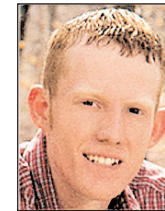
BROCK Berkeley Springs